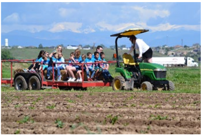
Berry Patch Farms giving this class a tour.