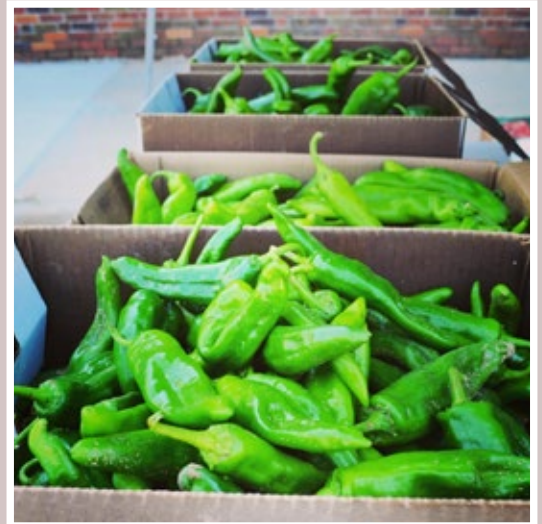
Fresh local produce sold at Market Day.

IN 2015, BRIGHTON'S WASTEWATER TREATED 774.8 MILLION GALLONS OF WATER