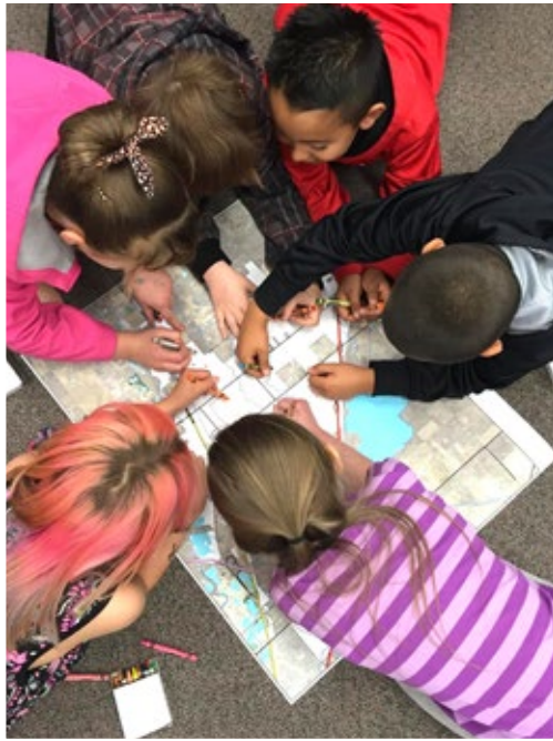
Future city planners at the 13th Southeast Elementary School Second Grade Classes Government Tour.