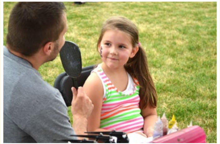
Face painting at the Brighton BBQ.