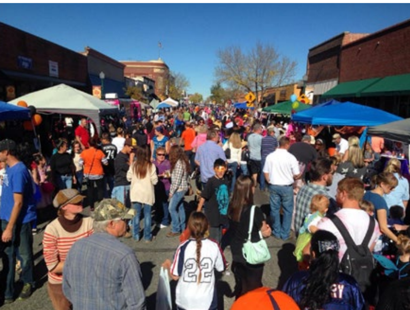
Fall day on Main Street for the Downtown Harvest Festival.