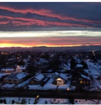
Gorgeous sunset from City Hall.